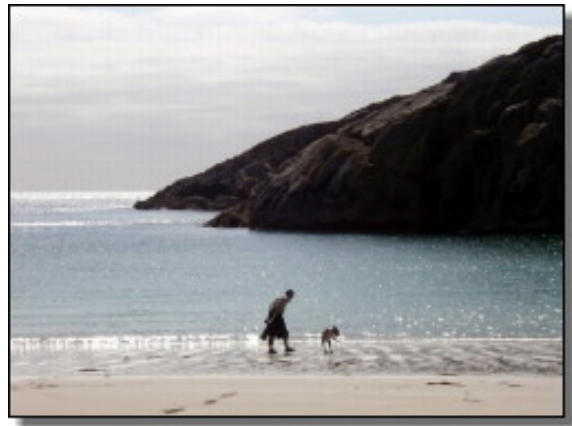
Above (left) Balfour beach on Erraid and (right) Ship's Captain and ship's dog on the beach.

Sat 17 Apr | No missing guests!!! The weather had deteriorated overnight with rain and a fresh south westerly wind blowing. Guests had hoped to land on Cairn Na Burgh Mor and Cairn Na Burgh Beg at the Treshnish Isles. Legend has it that the library from St Colomba's on Iona was buried and hidden here and a new archaeological investigation and dig on this site is due soon. The weather, however, prevented landing and all aboard had to be satisfied with cruise close to the two islands instead. Lunch was taken in Soriby Bay in Loch Tuath.